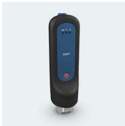
SKF QuickCollect Sensor

SKF ProCollect provides on the spot analysis and indications of machine problems and severity, enabling the planning of proactive maintenance and corrective actions.